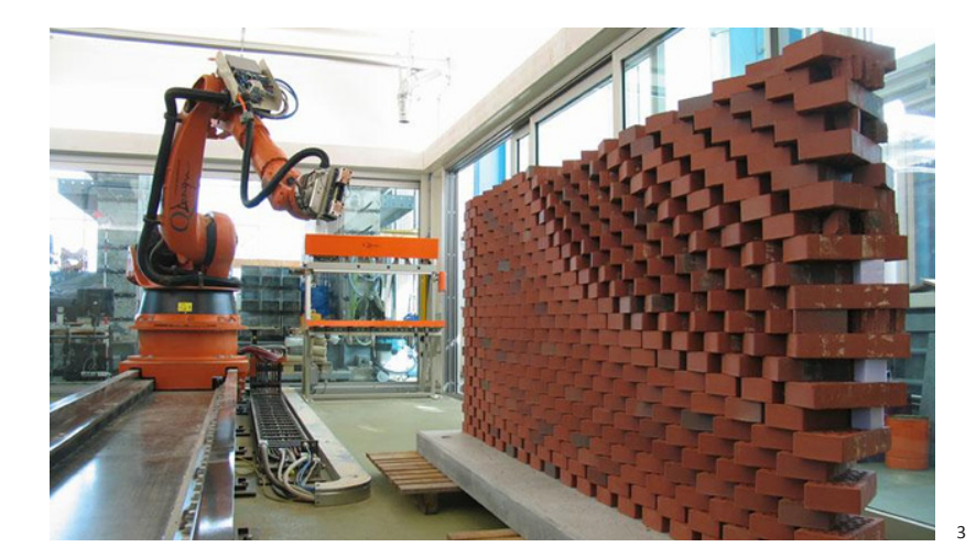
Figure 3: Programmed Wall, 5-axis robot building one of the wall scripts.

The course is described as a step toward future building practices: "if the basic manufacturing conditions of architecture shift from manual work to digital fabrication, what design potential is there for one of the oldest and most widespread architectural elements -- the brick?"<sup>14</sup> The students explored a process that could be the future of masonry construction. Unlike a brick mason, the robot can position each brick precisely, without reference or measurement, and therefore, can work quickly and efficiently. Students exploited this ability by "developing algorithmic design tools that informed the bricks of their spatial disposition according to procedural logics."<sup>15</sup> Designing parametrically with software in this fashion links a part with the whole through a set of defined geometric relationships. This process fosters the potential for the design of a module that acquires multiple variations as it is instantiated across a field. "Even as the design of the field and the module differ, together they invariably form a tessellated pattern."<sup>16</sup> So, instead of designing the geometry of the wall, the students were able to design the constructive logic that can have many formal architectural applications.